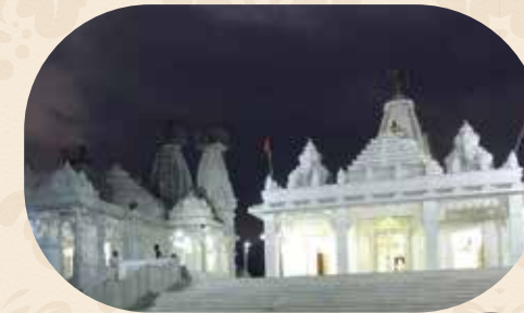
Shri Bhrahmharishi Ashramam

Jaycon Gateway Tirupati is strategically located near prominent landmarks, making it ideal for residents and visitors. Close to Shri Bhrahmharishi Ashramam, it offers a serene retreat. Nearby attractions like Anpalayagunta, Ashok Palace, ISKON Temple, Siddheshwar Matt, and Aivelu Mangapuram enhance its spiritual and cultural appeal. The proximity to the Taj Hotel adds elegance and convenience, while Shilparamam offers a glimpse into the region's rich heritage and crafts. With such a vibrant neighborhood, Jaycon Gateway Tirupati promises a lifestyle blending convenience, culture, and spirituality seamlessly.