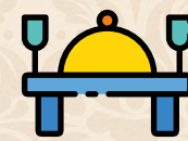
Food Court & Pantry