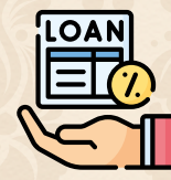
Bank Loan Available